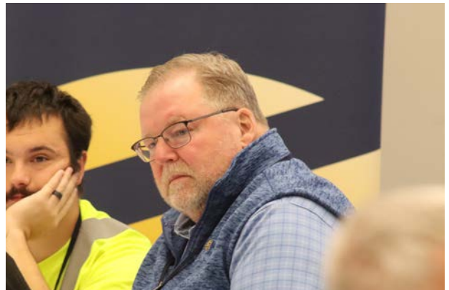
Above: Hillsboro Mayor Lou Thurston. Below: Participants in the KPP Energy Grid Ex VII exercise.