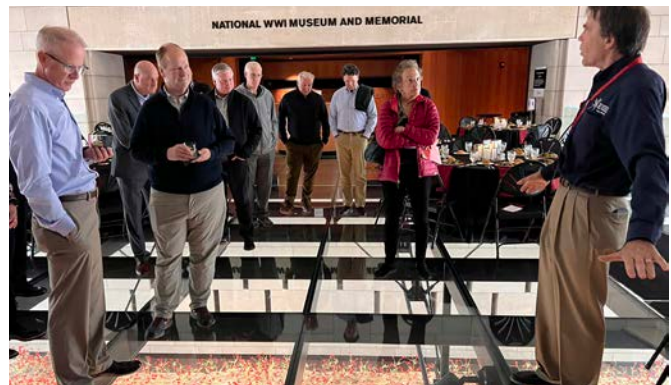
Above: TAPS Fall Conference included a tour of the National World War I Museum and Memoria.