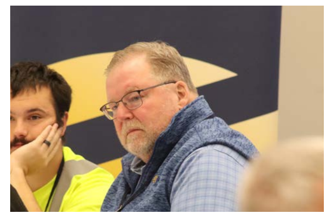
Above : Hillsboro Mayor Lou Thurston. Below: Participants in the KPP Energy Grid Ex VII exercise.