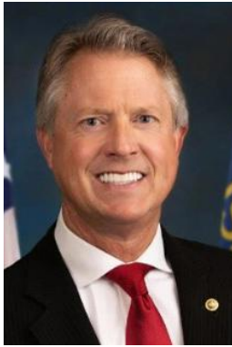
U.S. Senator Roger Marshall

of the grid. In announcing the proposed rule, DOE said that it “represents a strategic step to advance the diversification of transformer core technology, which will conserve energy and reduce costs. Almost all transformers produced under the new standard would feature amorphous steel cores, which are significantly more energy efficient than those made of traditional, grain-oriented electrical steel.”