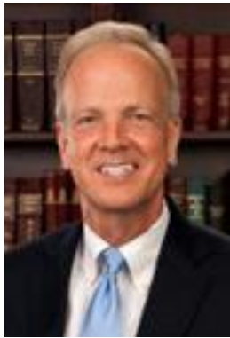
U.S. Senator Jerry Moran

On December 28, 2022, DOE announced it was proposing new energy efficiency standards for distribution transformers to improve the resiliency