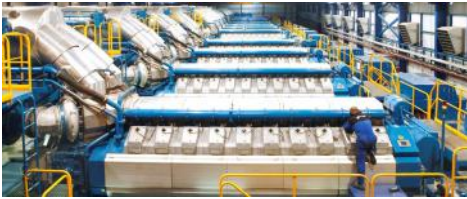
Typical configuration shown for interior of Wartsila power plants

The Brattle Group was engaged for the study in February this year. Analyzing and evaluating the historical and future performance of Wartsila “quick-start” technology was the objective. Wartsila technology has been under intense consideration since it was first suggested to Members at the Fall Planning Retreat of 2015 in Kansas City, KS. The final phase of the study is expected to be completed by the end of June.