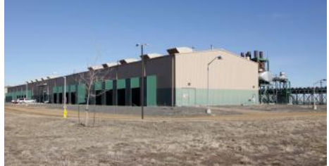
Typical configuration shown for exterior of Wartsila power plants

Planning Retreat last September. Beginning with membership approval given in 2018 for a formal site location and economic study, progress has been made in refining cost and revenue projections as well as resource adequacy for future years.