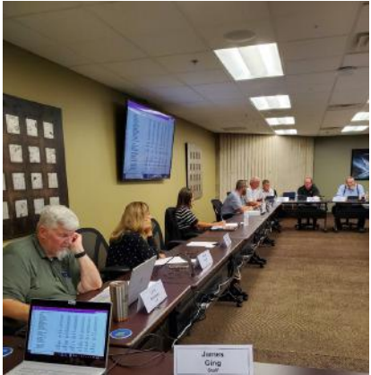
The KPP Board and others listen on July 15th to the employment search discussion