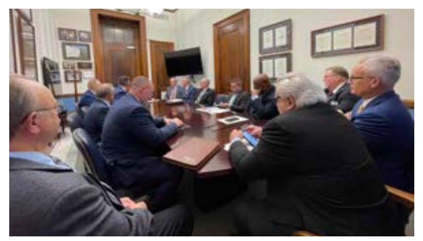
Above: Kansas delegation meeting with Senator Roberts staff.