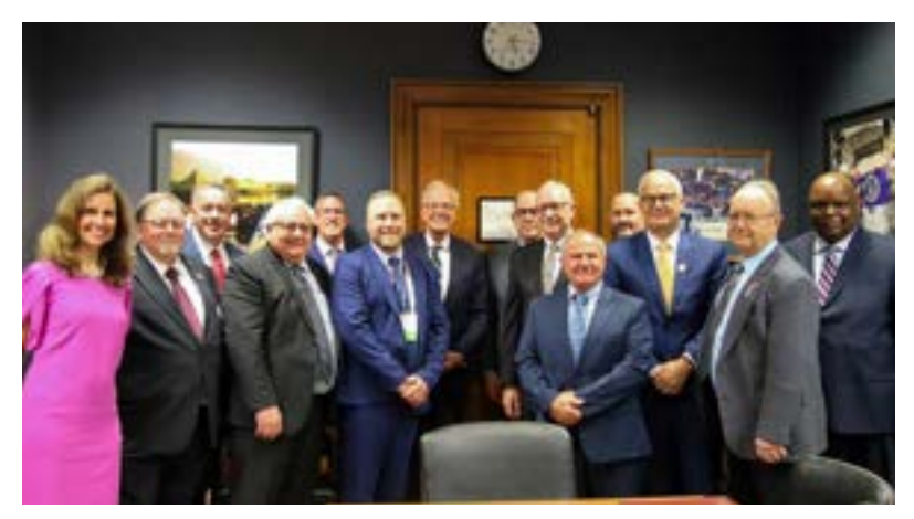
Above: The entire KMU delegation with U.S. Senator Jerry Moran.